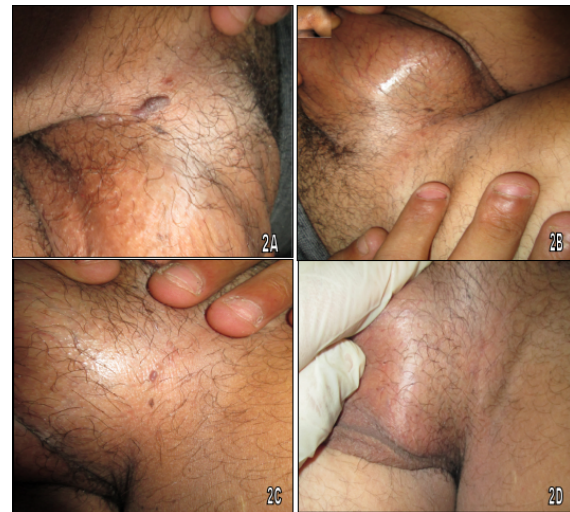
Fig. 2. A case of 36 years old male patient presented with genital warts on right and left groin areas before and after PPD injection. A case of 36 years old male patient presented with genital warts, located on the right and left groin areas. Before PPD injection, serum IL-17 level was 79.3 Pg/mL. After injection, serum IL-17 level was 110.3 Pg/mL. (A) Right groin warts before PPD injection, (B) complete removal of warts in right groin area after 6 sessions of PPD injection, 2 weeks interval, (C) Left groin warts before injection and (D) complete removal of warts in left groin area after PPD injection.

Immunotherapy is a promising upcoming therapeutic line of management of numerous and difficult to treat genital warts as it can cause complete wart recovery with minimal injury, pain or scarring and relatively in short duration, as well as it improves the host immune reactivity against human papilloma virus, which leads to high little recurrence rates [18]. Immunotherapy is considered an economi-